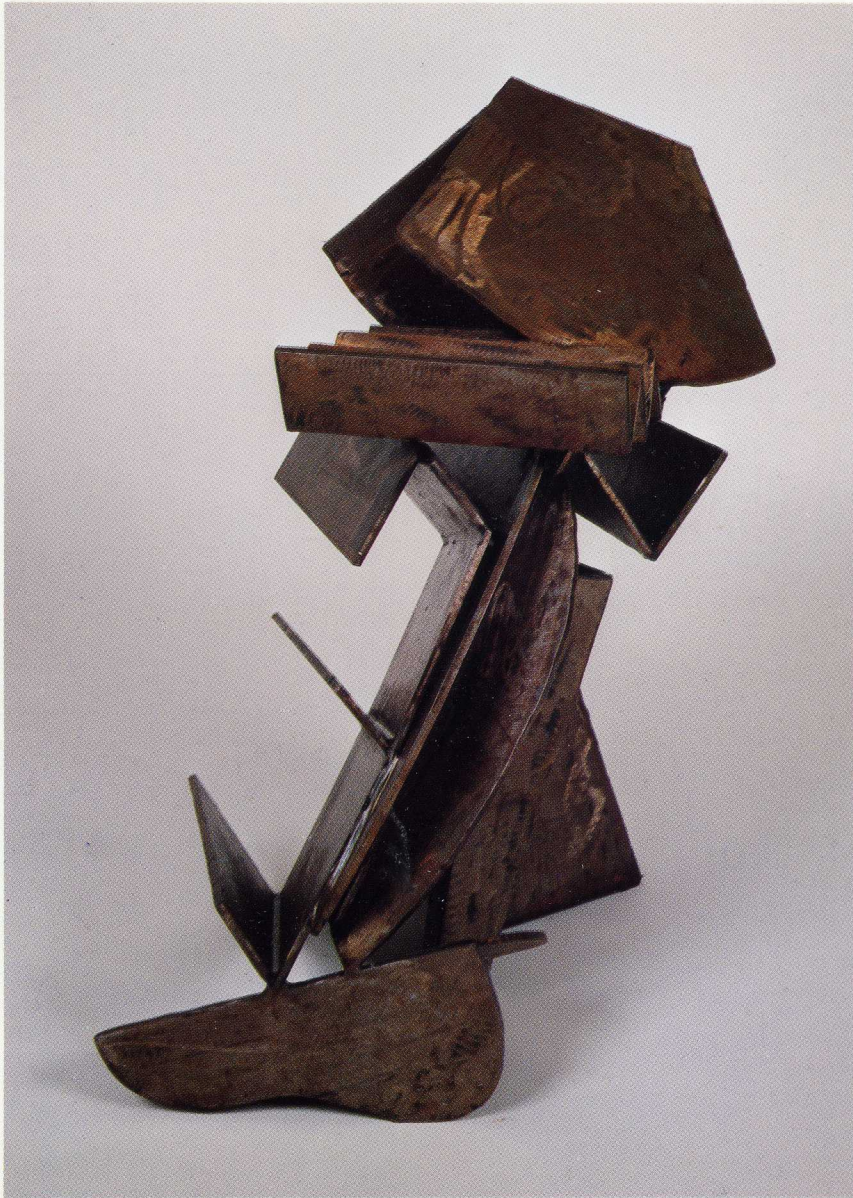
Jasmine 1981 29 x 24 x 18 in. welded steel