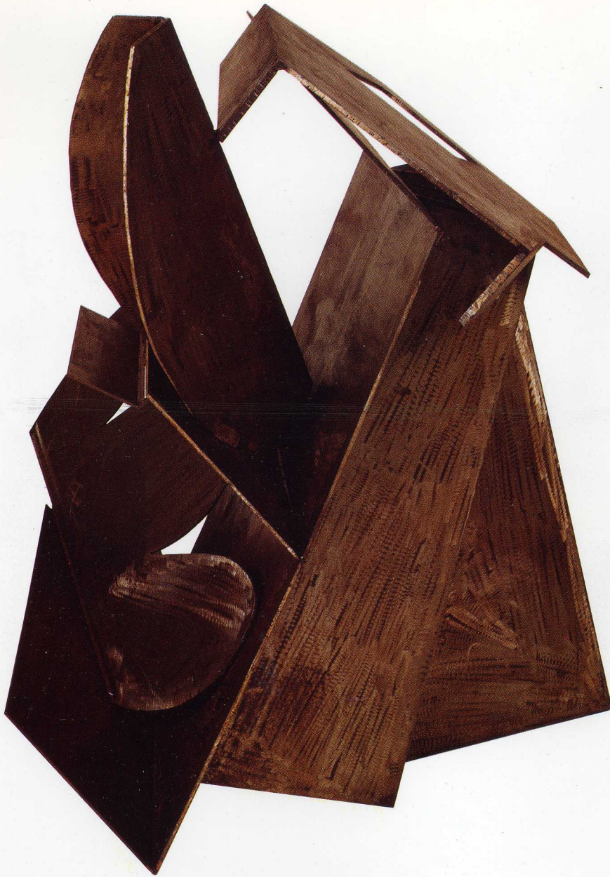
Rye Square Notebook 1981 56 x 67 x 41 in. welded steel