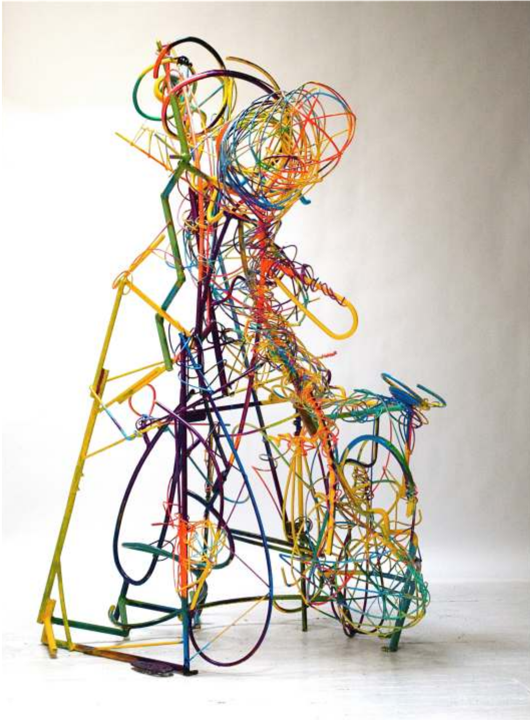
Drunken Angel - 2011