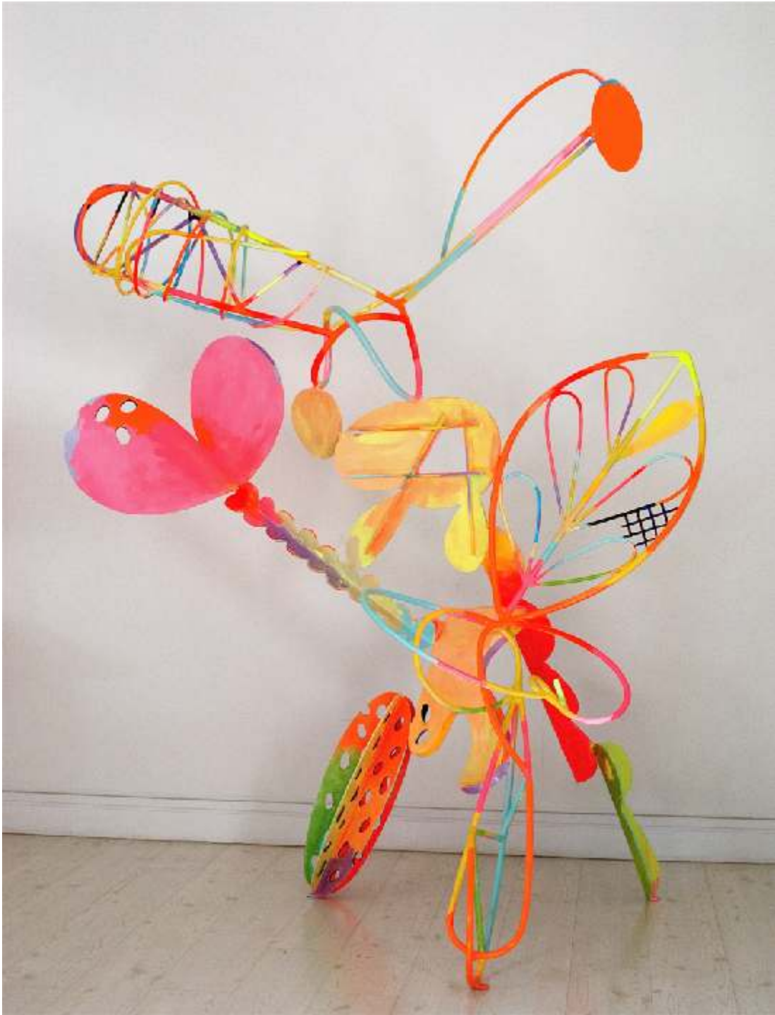
Dear Vincent - 2010 Stainless steel and enamel, 88"x68"x47"