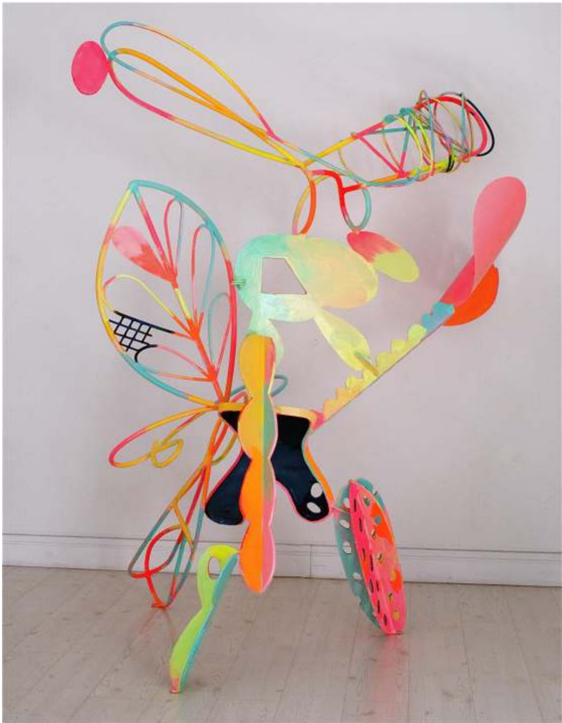
Dear Vincent - 2010