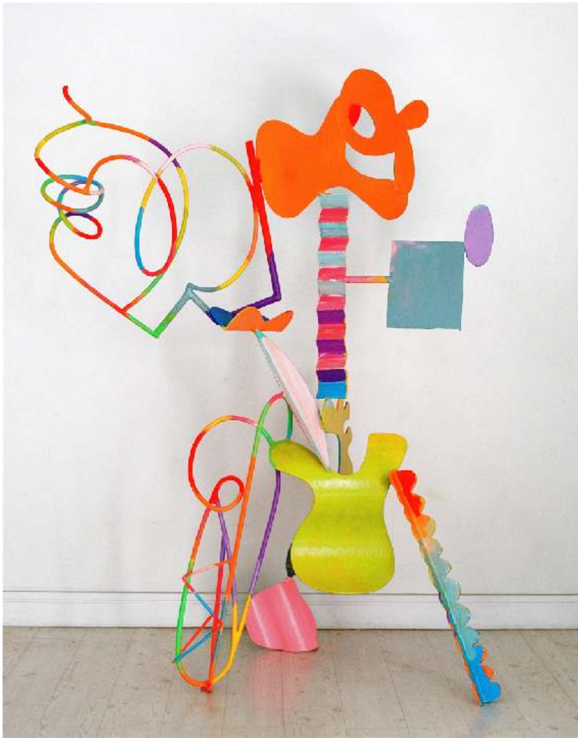
Hip Shaken Mama - 2010 Stainless steel and enamel, 86"x64"x32"