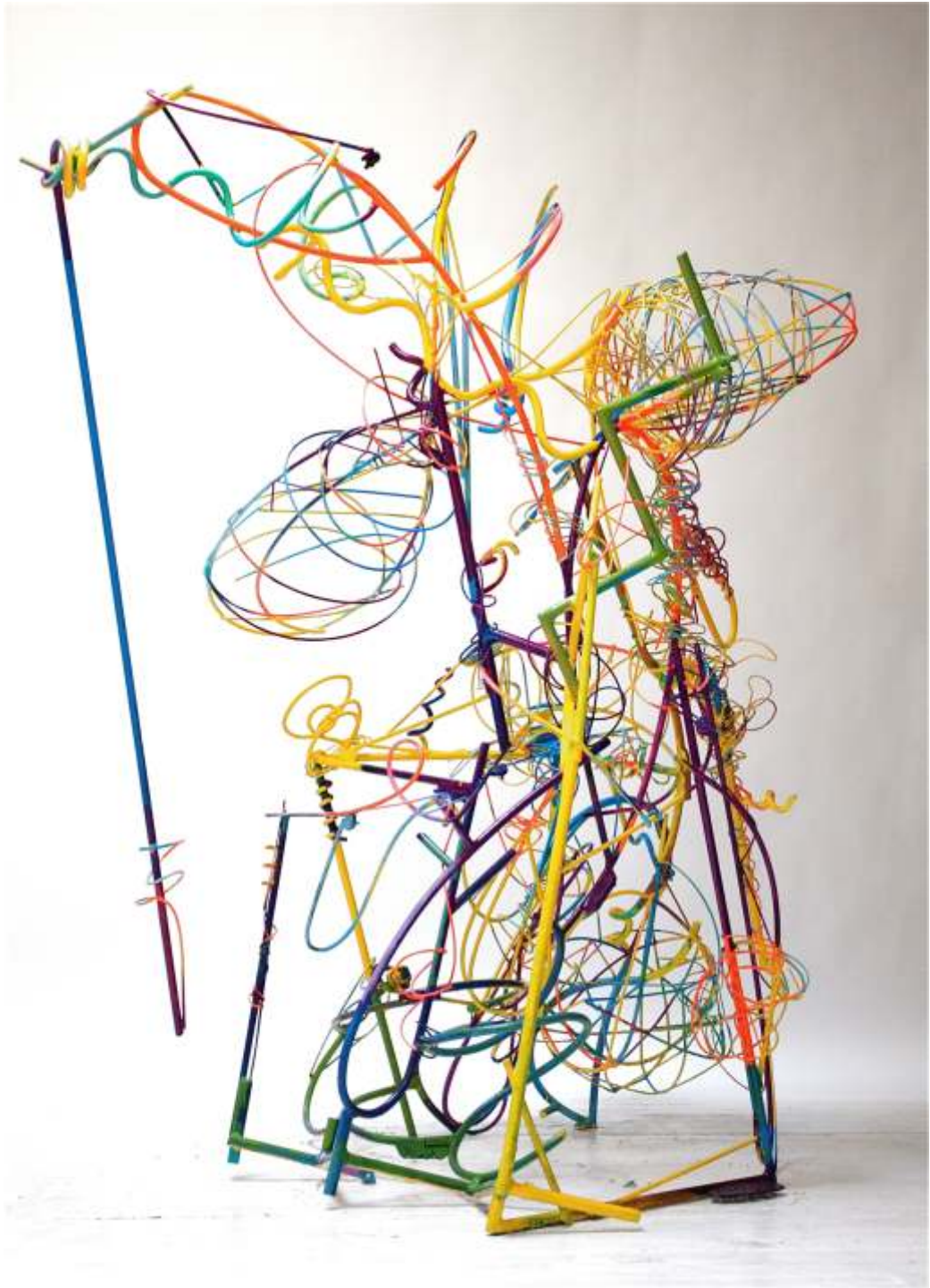
Drunken Angel - 2011 Stainless steel and enamel, 92"x79"x60"