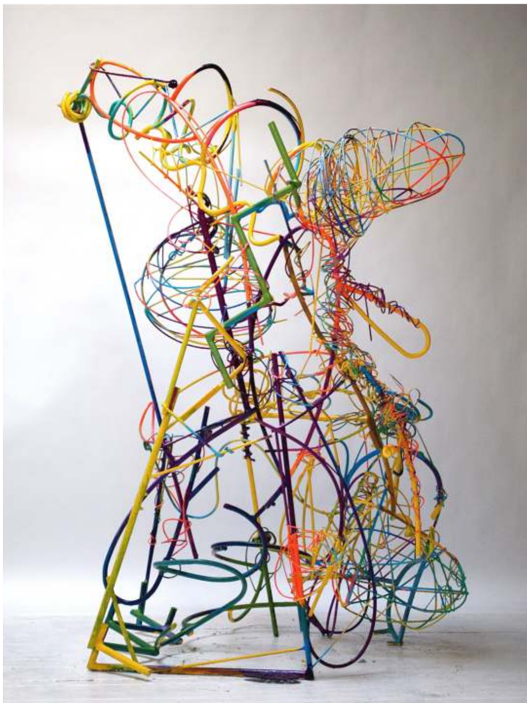
Drunken Angel - 2011