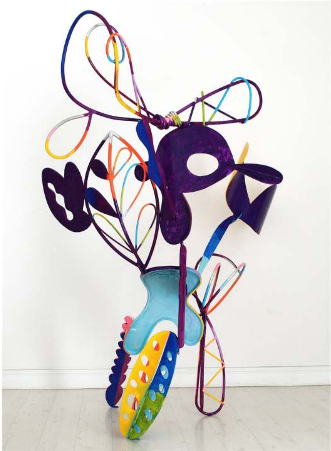
Dear Purple - 2011