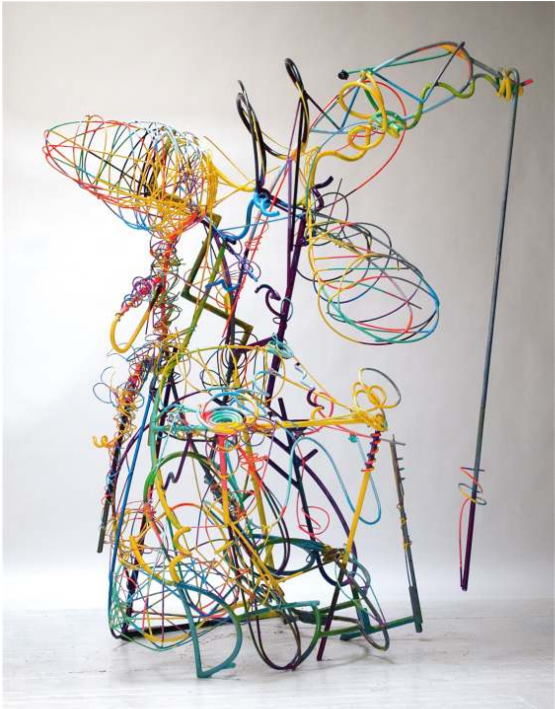
Drunken Angel - 2011