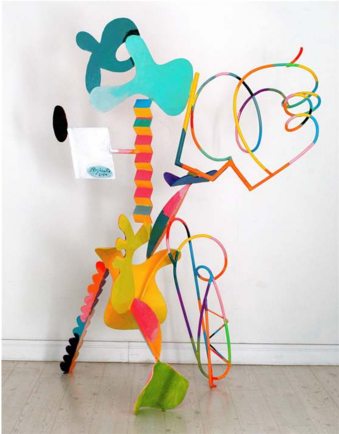
Hip Shaken Mama - 2010