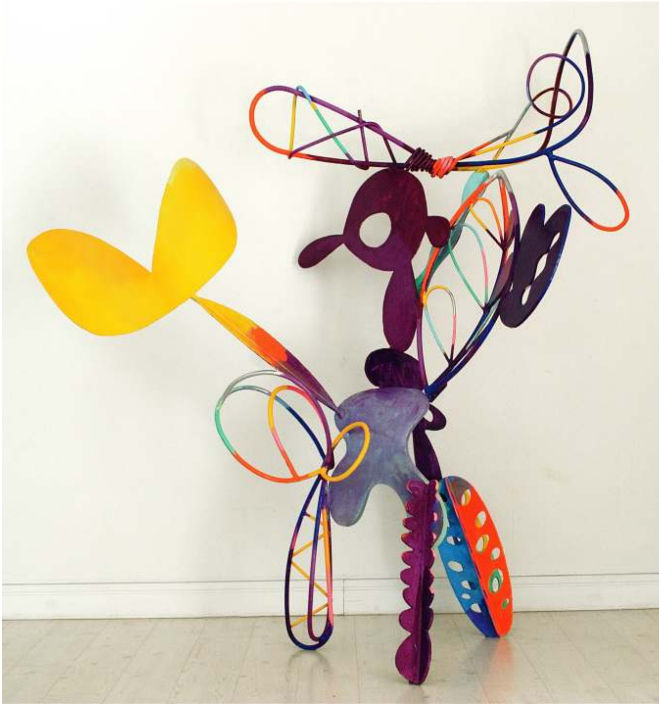
Dear Purple - 2011 Stainless steel and enamel, 89"x78"x43"