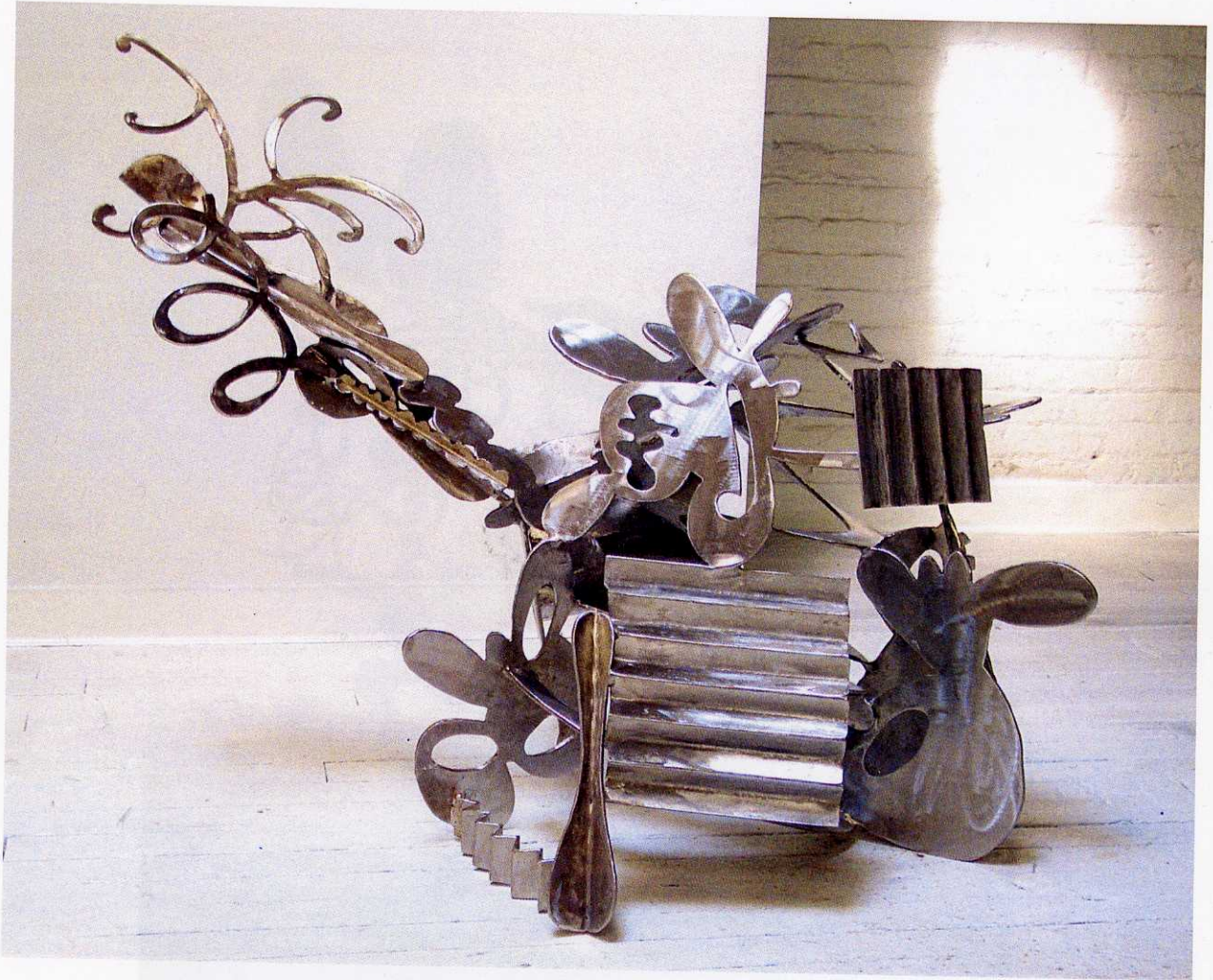
Mound of Mo - 43 x 50 x 34 inches - welded stainless steel - 2006