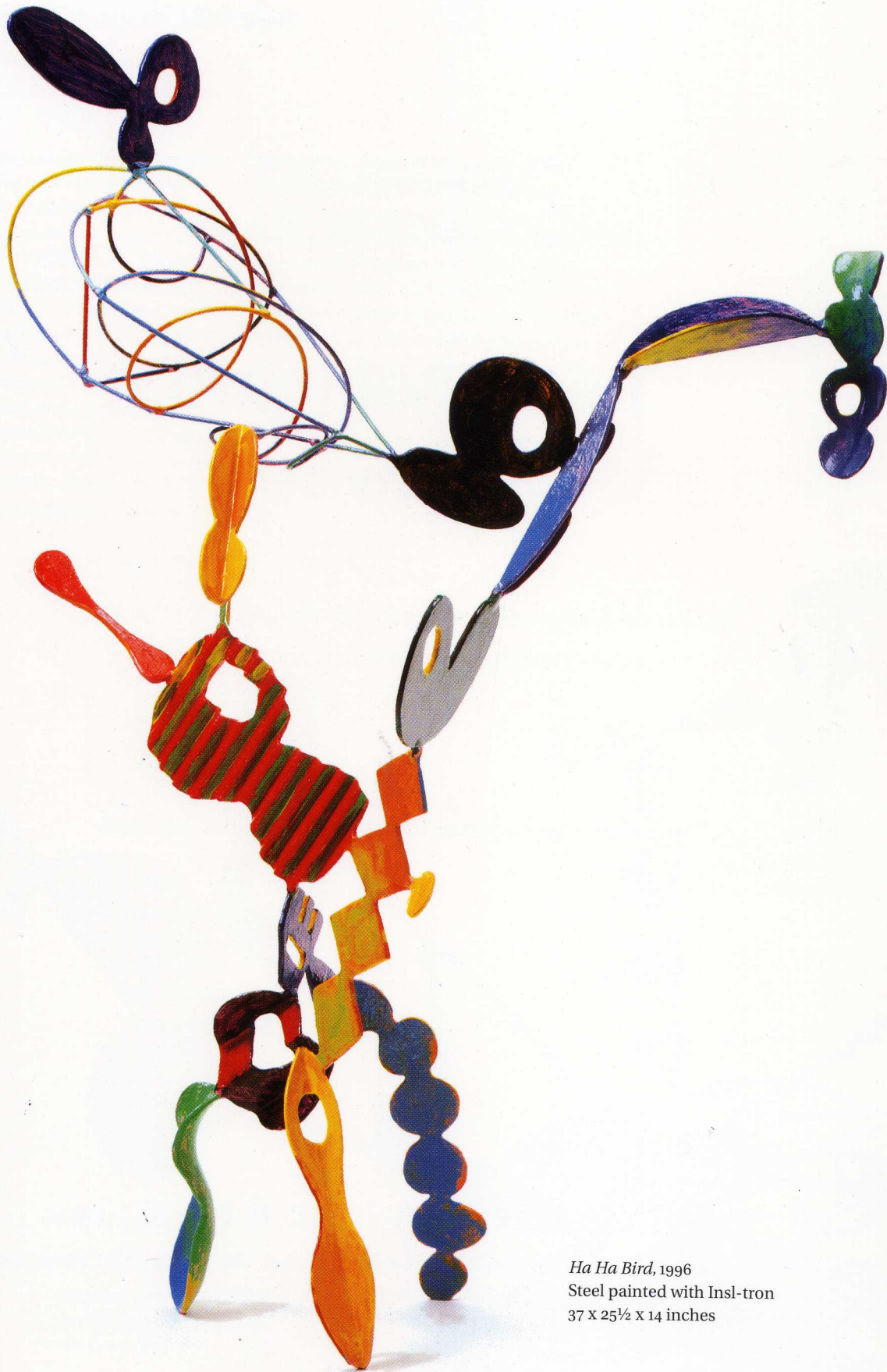
Ha Ha Bird , 1996 Steel painted with Insl-tron 37 x 25½ x 14 inches