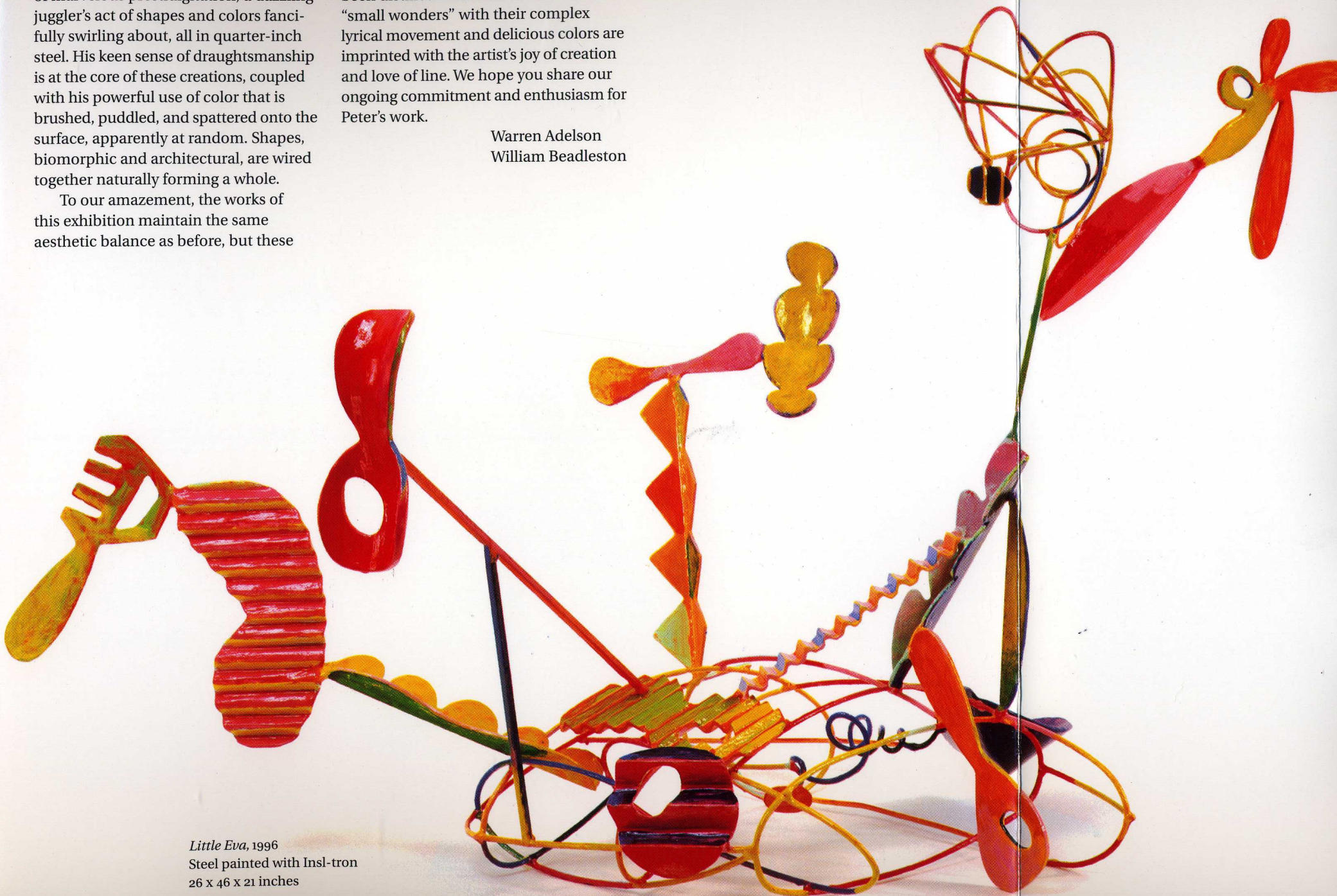
Little Eva , 1996 Steel painted with Insl-tron 26 x 46 x 21 inches